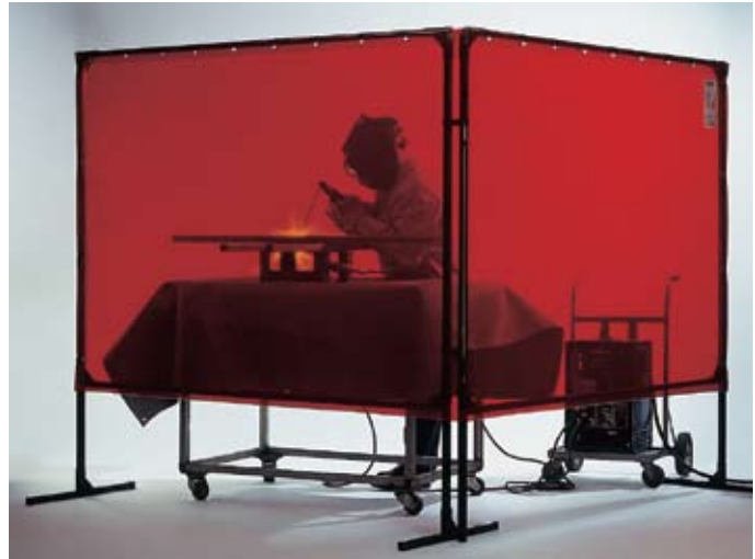
Optional Accessories: Casters and inspection window. Custom sizes available upon request.

Complete package includes square steel frame, brackets, platform "T" legs, lacing ties and safety curtain. Wilson Stur-D-Screens are shipped disassembled.