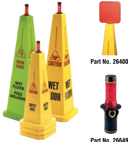
Part No. 26400