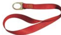
Part No. 10042792

Part No. 10042794- PointGuard™ Concrete Anchorage Connector Strap