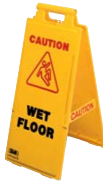
Part No. 24102