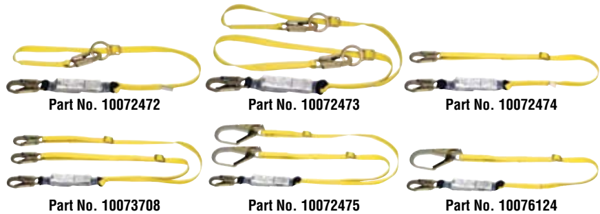
Part No. 10072472