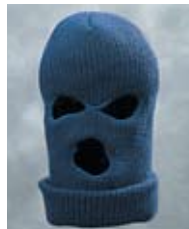
Full Face Knitted Cap Navy Part No. 1078-01