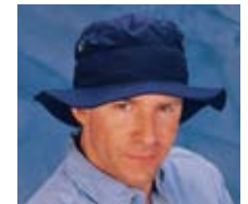
Part No. 962-L