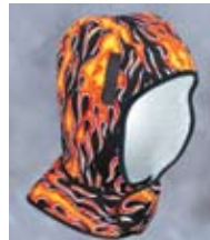
Part No. ZZS-FLA