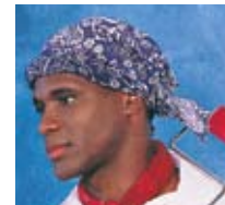
Part No. 956-06