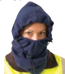
Navy Part No. 1070-01