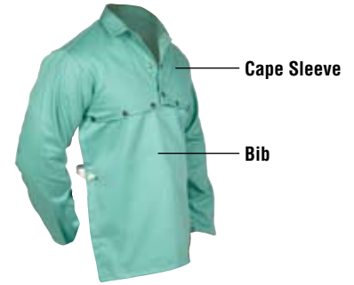
Part No. 940-6 cape sleeve