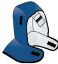
Part No. SS550