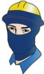
Full face coverage Part No. LK810FR-01