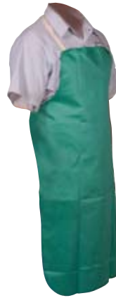
Part No. 940-22

Part No. 940-26: 24" x 36" split bib apron