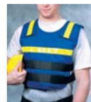
Part No. PC2B (front)