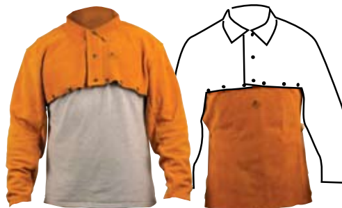
Part No. 910-6

Part No. 910-7-20: 20" Bib for more protection