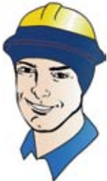
Part No. RK800FR-01