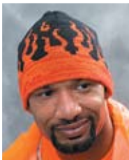
Black/Orange Flames Part No. 1077-FLA