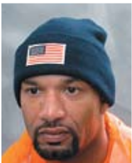
American Flag on Navy Part No. 1074-01