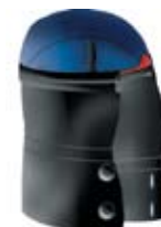
Part No. LZ620