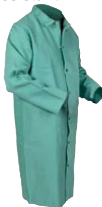
Part No. 940-545