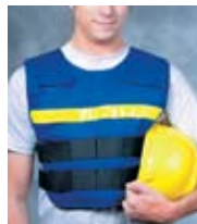
Part No. PC2A (front)