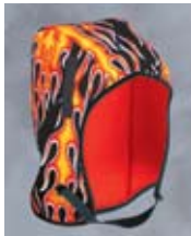
Part No. ZSL-FLA