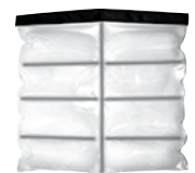
Cooling pack pair Part No. PCP2