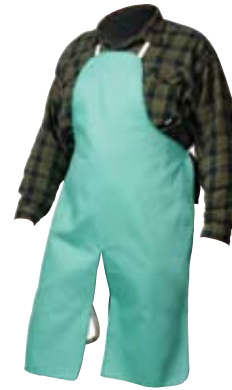
Part No. 940-26