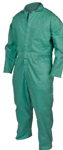
Part No. 940-641