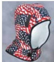
Part No. ZZS-WAV