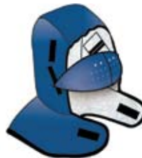
Part No. SS551