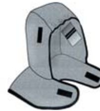
Part No. SF560