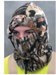
Camouflage Part No. 1070-CAMO