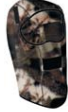
Camouflage Part No. LF649