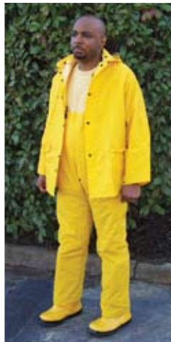
Part No. 3100 Part No. 3910