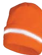
Part No. LUX-KCR-HVO