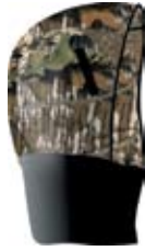
Camouflage Part No. LF659