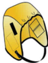
Part No. RG200