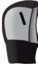
Black/Silver Part No. LF655