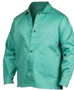
Part No. 940-1