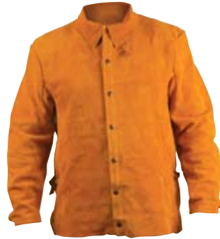
Part No. 910-1

Part No. BT910-1: S, M, L, XL, XXL, XXXL, XXXXL (Buck tan)