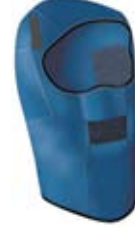
Navy Part No. LF648