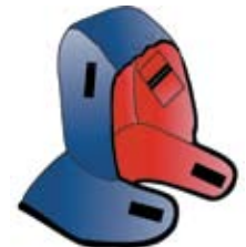
Part No. SB505