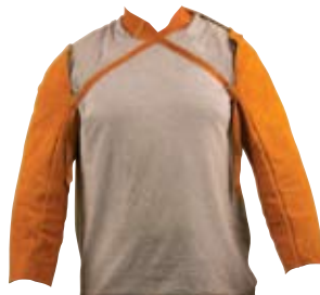
Part No. 910-12