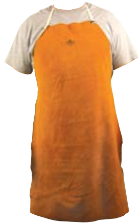
Part No. 910-22

Part No. 910-24: 24" x 48" split bib apron