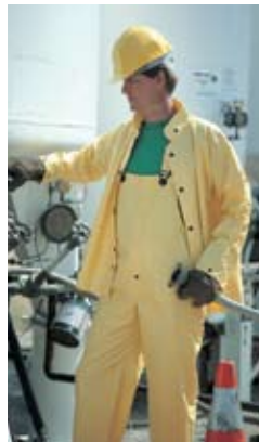
Part No. 3102 Part No. 3912