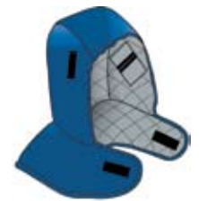
Part No. SX700