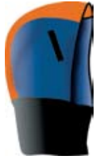
Navy/Orange Part No. LF653