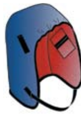
Part No. LB600