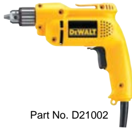
Part No. D21002