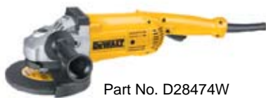
Part No. D28474W