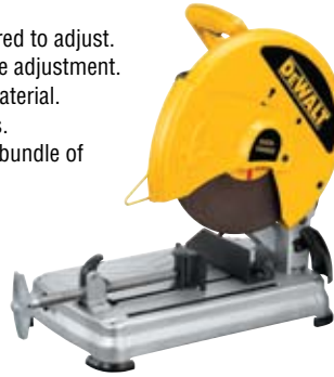
Part No. D28715