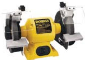
Part No. DW756