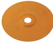
Part No. DW4951