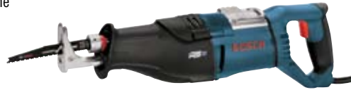
Part No. RS10