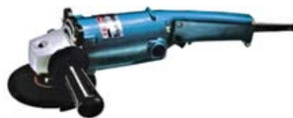
Part No. 9005B