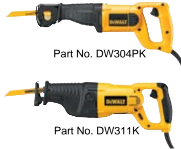
Part No. DW304PK

Part No. DW311K- Comes with orbital action and keyless adjustable shoe.