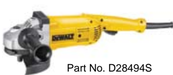
Part No. D28494S