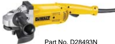
Part No. D28493N