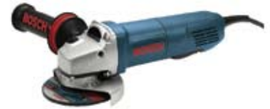
Part No. 1810PS