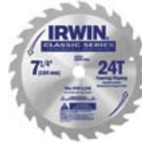
Part No. 25130