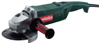
Part No. 606410420