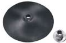
Part No. DW4990 w/ clamp nut