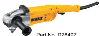
Part No. D28497