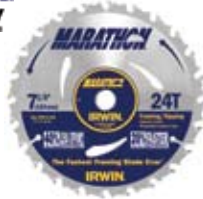
Part No. 24030