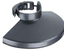
Part No. D284937

Provides safe operating conditions when using depressed center wheels.