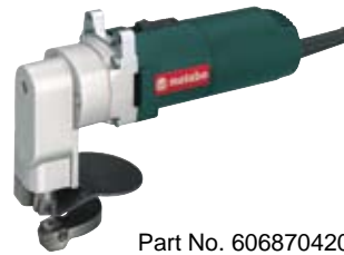
Part No. 606870420