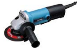
Part No. 9557PB