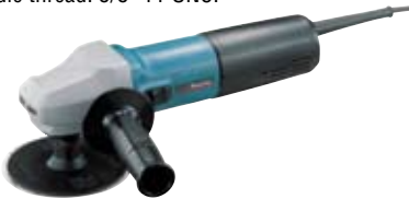
Part No. 9564CV