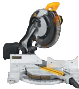
Part No. DW715