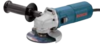
Part No. 1347A