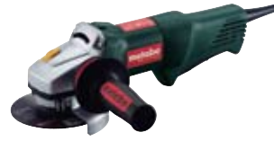
Part No. 606208420