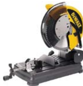
Part No. DW872