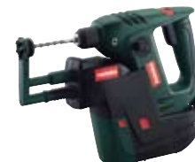
Part No. 600403420