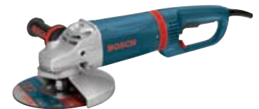
Part No. 1894-6