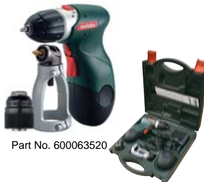
Part No. 600063520