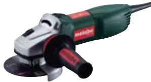
Part No. 606204420