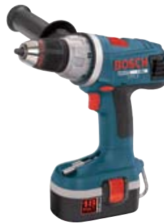
Part No. 33618-2G