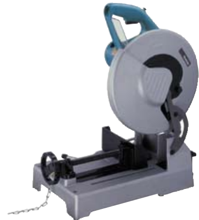
Part No. LC1230