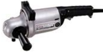
Part No. GA7911