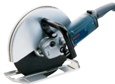
Part No. 1364