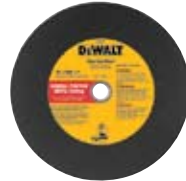
Part No. DW8001