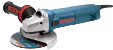
Part No. 1806E