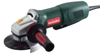
Part No. 601452420