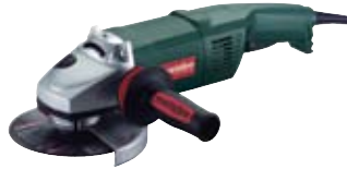
Part No. 606251420