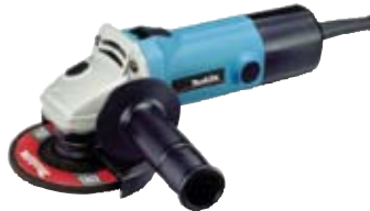
Part No. 9554NB