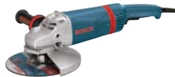
Part No. 1873-8