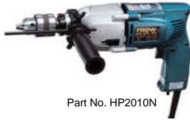
Part No. HP2010N