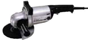
Part No. GA7001L