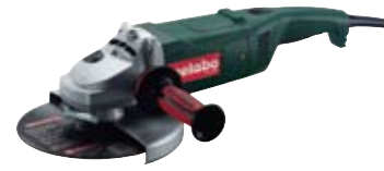
Part No. 606415420