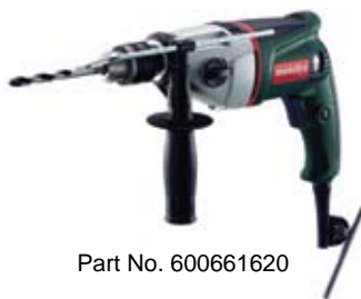
Part No. 600661620