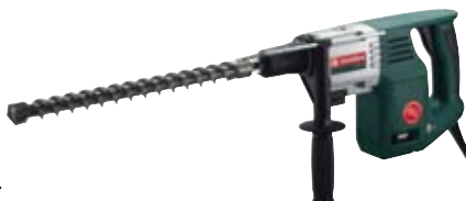
Part No. 600232420