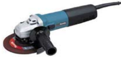
Part No. 9566CV