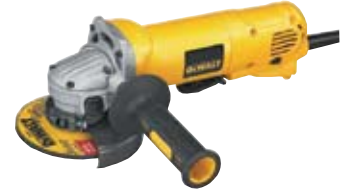
Part No. D28402