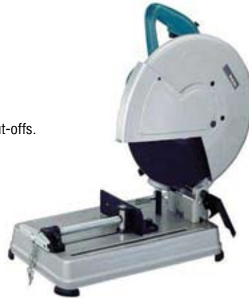
Part No. 2414NB