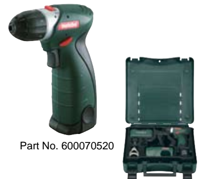
Part No. 600070520