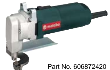
Part No. 606872420