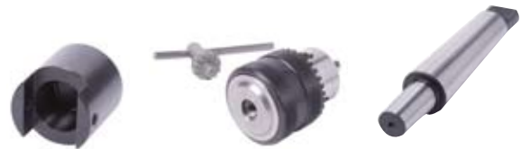
Part No. HTA46

Chucks and adaptors to enable twist drills to be fitted to Evolution® Magnetic Drills.