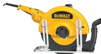
Part No. D28755