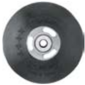
Part No. DW4947