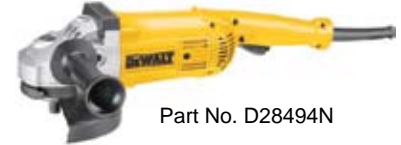
Part No. D28494N